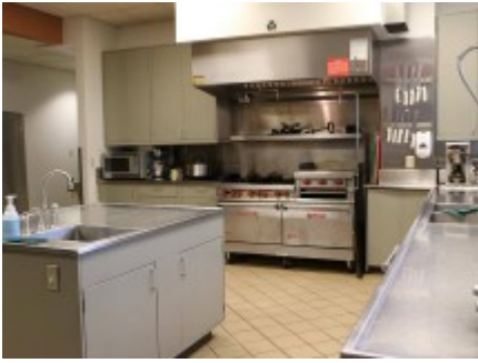
Kitchen at Station 91