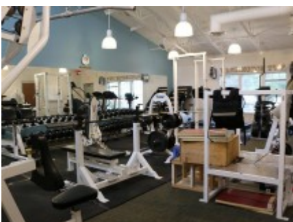
Station 91 Gym