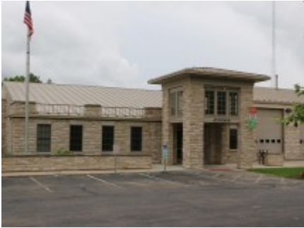
Front view of Building